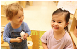
Child Care Services

After years of planning, construction and hard work to make the Bettie Allard YMCA a reality, we were thrilled to open the doors to the Coquitlam community on January 17, 2023. It was wonderful to see the building come to life with members enjoying the amenities—children learning to swim, and the strength and conditioning zones and group fitness classes full of people working toward their goals. There was no shortage of enthusiasm for YMCA BC’s newest centre of community with more than 3,000 members signed up ahead of the opening. This day would not have been possible without the dedication of our cabinet volunteers and the generosity of capital donors.