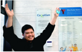
Bettie Allard YMCA (pictured right)

After years of planning, construction and hard work to make the Bettie Allard YMCA a reality, we were thrilled to open the doors to the Coquitlam community on January 17, 2023. It was wonderful to see the building come to life with members enjoying the amenities—children learning to swim, and the strength and conditioning zones and group fitness classes full of people working toward their goals. There was no shortage of enthusiasm for YMCA BC’s newest centre of community with more than 3,000 members signed up ahead of the opening. This day would not have been possible without the dedication of our cabinet volunteers and the generosity of capital donors.