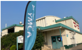
Taylor Community Pool

We were proud to further extend our quality child care services across BC. This included assuming operations of an existing centre in Tumbler Ridge and the launch of a new school-age program in Pouce Coupe—the result of a new partnership between YBC and the Peace River South School District. May 2023 marked the official opening of the 37-space Hummingbird Child Care Centre in Richmond and our Child Care program struck a partnership with Northern Health to run a unique child care pilot program in Fort St. John. This pilot program explored the viability of extended-day programming at our YMCA Robert Ogilvie Care and Learning Centre to accommodate Northern Health employees engaged in shift work that begins and/or ends outside the hours of typical child care facilities.