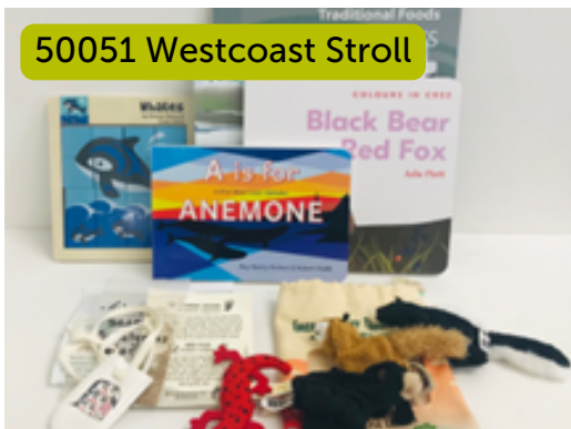
50051 Westcoast Stroll