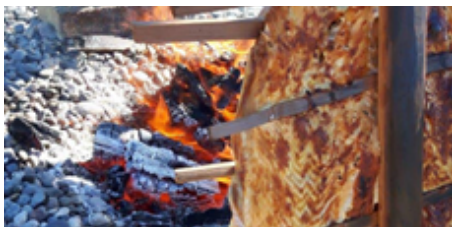
Traditional, Indigenous method of cooking Salmon.

Summer is all about family, friends and food! Food to share at picnics or BBQ's, maybe salmon or smore's around a campfire, or feasting from one of the many food trucks around our parks! Summer means family visiting from near or far, or maybe traveling to visit them by sea or car! Our lending library has many options to choose from that can inspire your child's imagination.