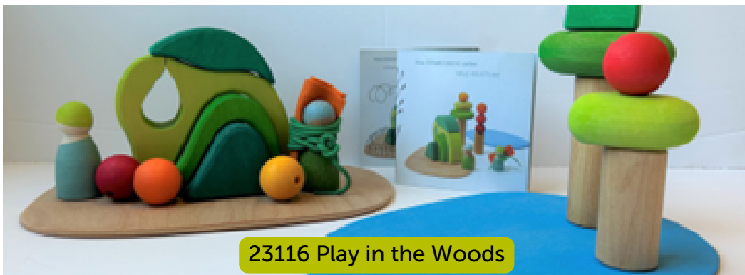
23116 Play in the Woods