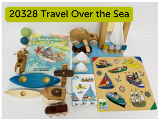
20328 Travel Over the Sea