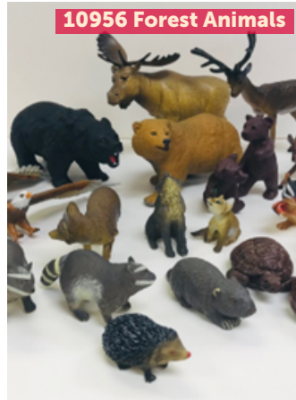
10956 Forest Animals