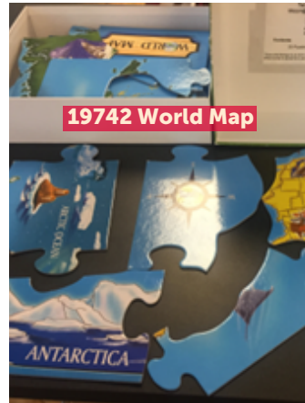
19742 World Map