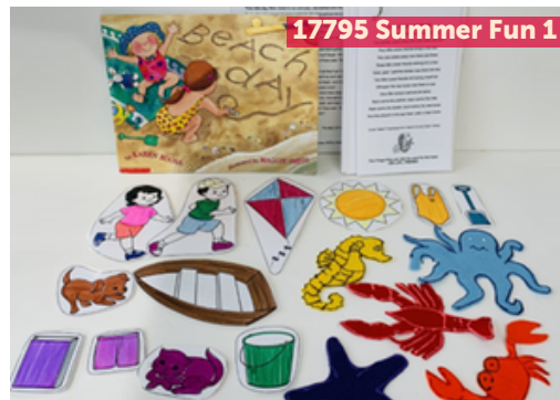
17795 Summer Fun 1