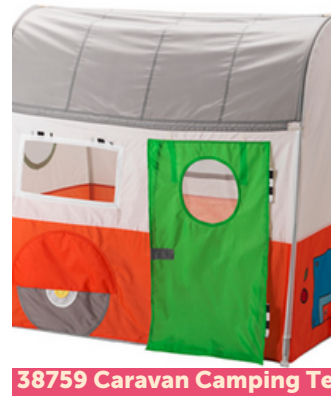
38759 Caravan Camping Tent