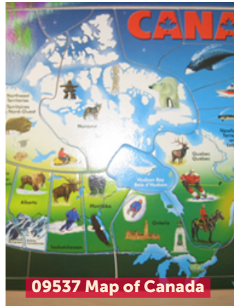
09537 Map of Canada