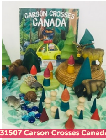
31507 Carson Crosses Canada