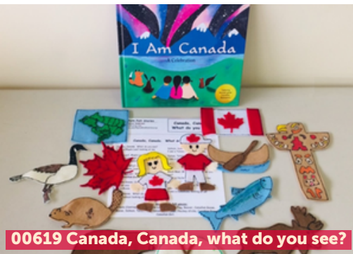
00619 Canada, Canada, what do you see?