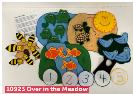
10923 Over in the Meadow