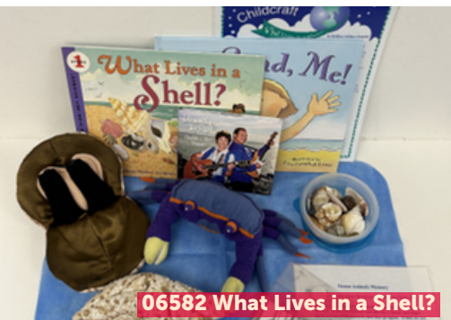
06582 What Lives in a Shell?