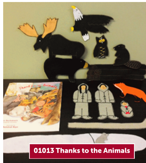
01013 Thanks to the Animals

October is also a lovely month for events and special days, including Diwali and Halloween!