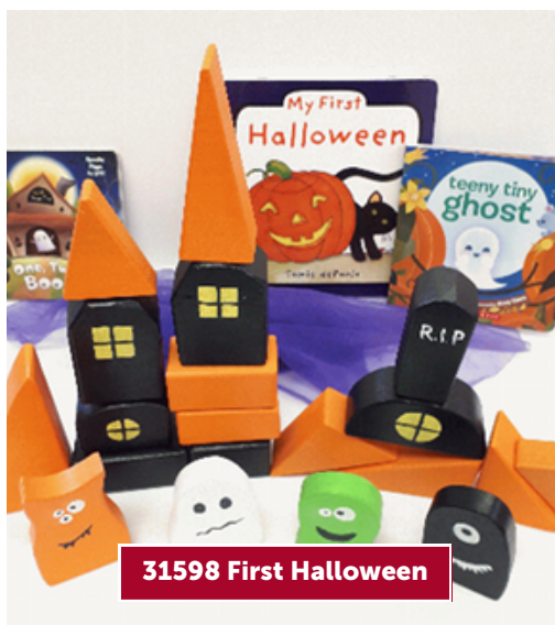
31598 First Halloween