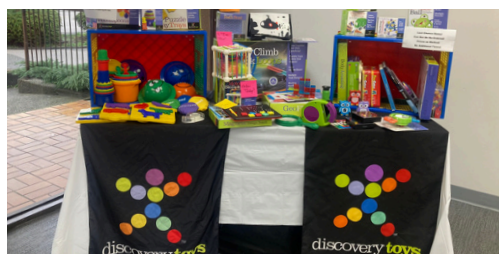
high quality vendors, door prizes, and so much more!