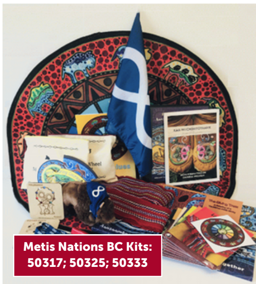
Metis Nations BC Kits: 50317; 50325; 50333

Additionally, Thanksgiving offers a wonderful opportunity to express gratitude while exploring the themes of growing, harvesting, and enjoying delicious food!