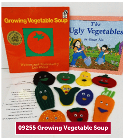
09255 Growing Vegetable Soup