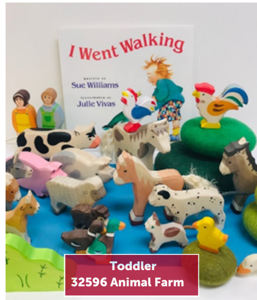
Toddler 32596 Animal Farm