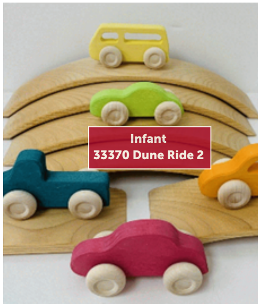
Infant 33370 Dune Ride 2