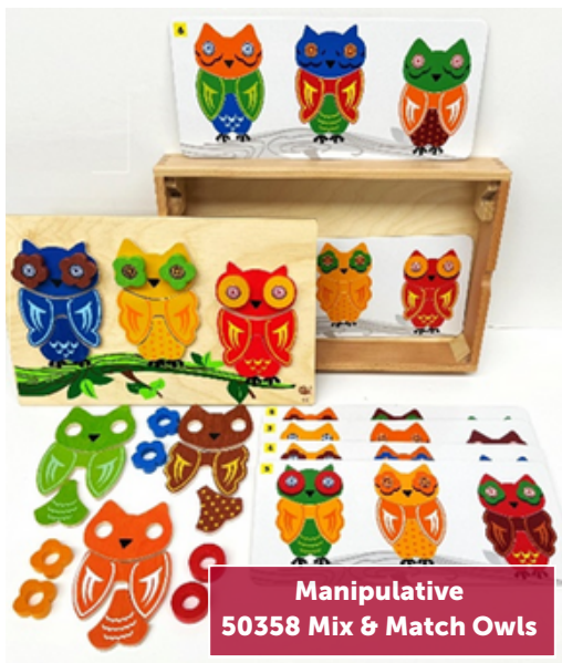
Manipulative 50358 Mix & Match Owls