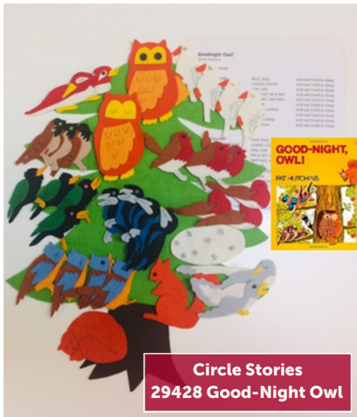
Circle Stories 29428 Good-Night Owl

We're kicking off the New Year by sharing some of our staff's favorite library resources! Stop by to chat with our team and discover how these resources can enrich your childcare program or be used with your child at home. Each featured resource below includes its shelf location within our early learning resource library for your convenience. Enjoy!