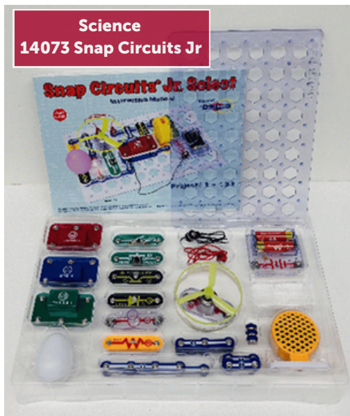
Science 14073 Snap Circuits Jr